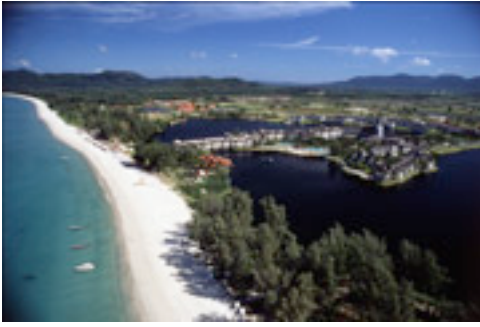
Property has private beach club on Bang Tao