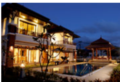
Private lap pools

PHUKET, 24 September 2009 – Outrigger Laguna Phuket Resort and Villas in Thailand will open 1 December 2009 with unbeatable value rates for guests. Until 31 March, 2011 the 229 square metre two-bedroom villa will sell at Thai Baht 6,000* (US$176), the 457 square metre three-bedroom pool villa will start sell at Thai Baht 9,000* (US$265), and the 604 square metre four-bedroom pool villa will be Thai Baht 13,000* (US$382).